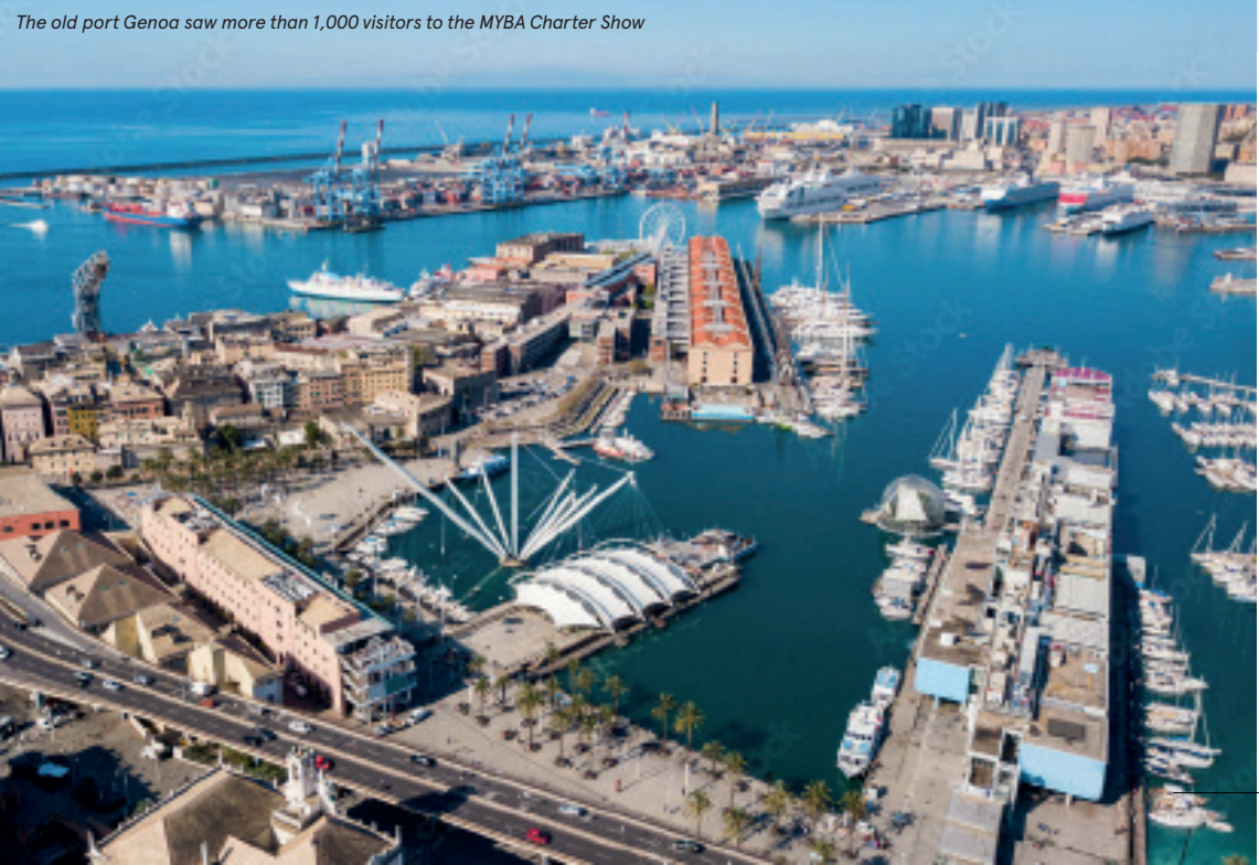
The old port Genoa saw more than 1,000 visitors to the MYBA Charter Show