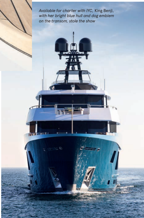
Available for charter with IYC, King Benji, with her bright blue hull and dog emblem on the transom, stole the show

The show drew to a close with a triumphant sounding of the horns and a crew party, sponsored by Genoa Superyacht Hub, which celebrated the 573 crew members who worked tirelessly to ensure the show’s success.